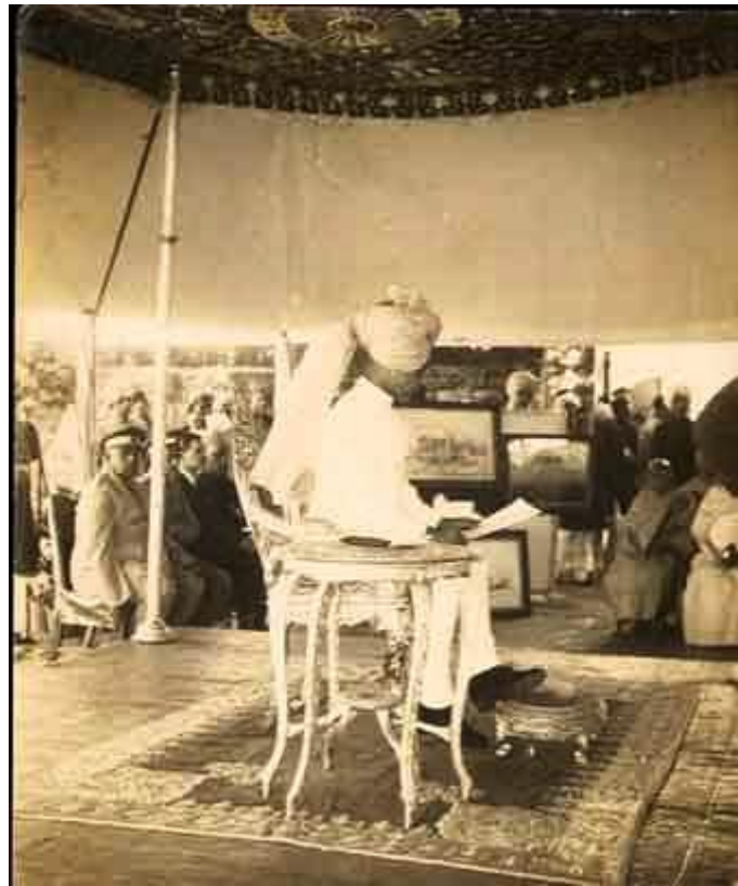
Fig.3- H.H Nawab Hamidullah Khan lays foundation stone at Sanchi on December 27, 1947.