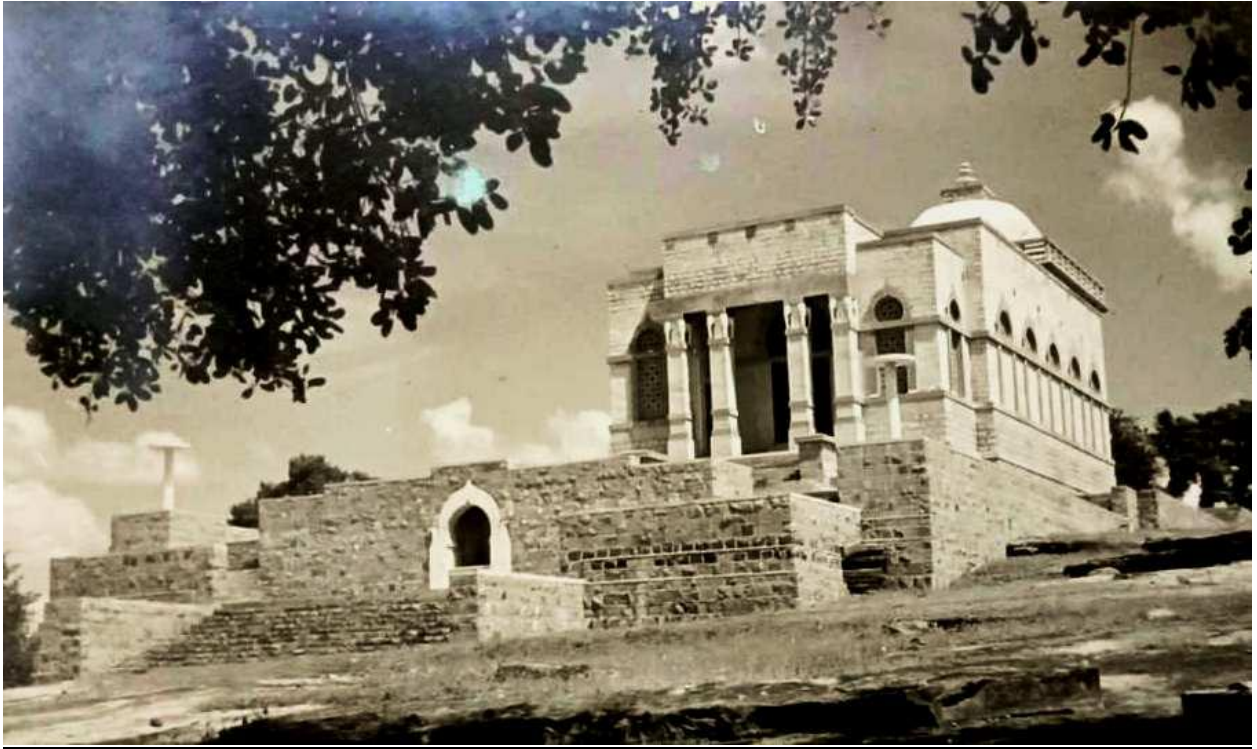
Fig. 5- Cetiyyiri Vihara at Sanchi