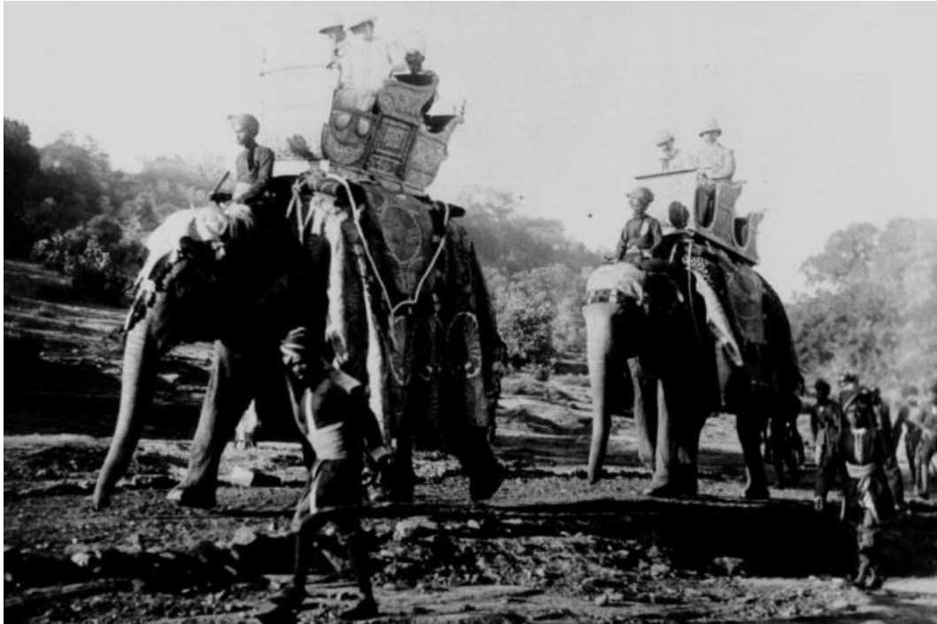
Fig.2- Lord Curzon and Lady Curzon Visit to Bhopal on 28 November 1911.